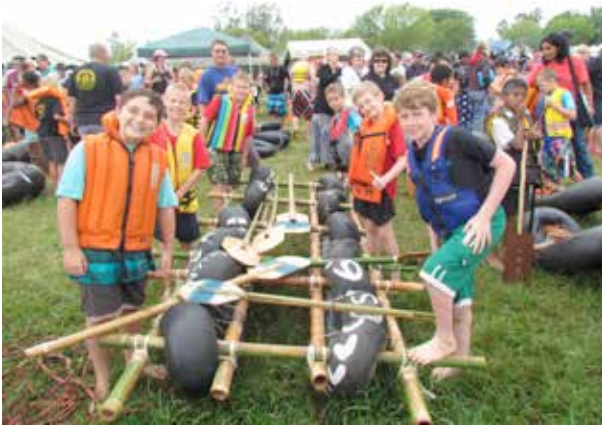
Cubs stand proudly alongside the constructed raft eagerly await starters instructions.